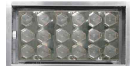
• Holder Plate (Option)